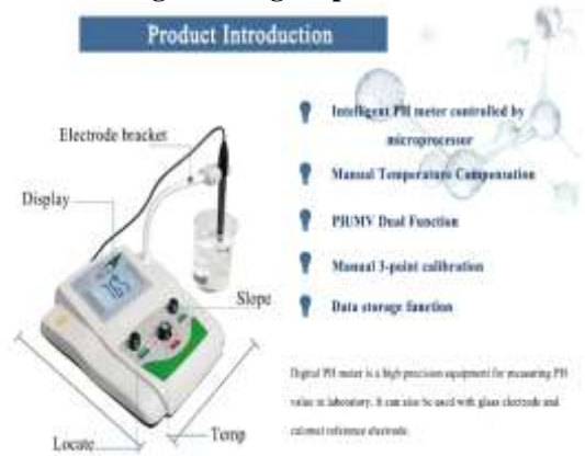
Figure 6:Digital pH meter

Digital pH meter is used in pharmaceutical industries to assure the pH of the solutions which is needed for the preparation of the drug, pH is very important to make assure the stability of the product.