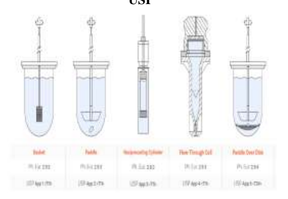
Figure 5:Dissolution test apparatus according to USP

Volume 7, Issue 1 Jan-Feb 2022, pp: 310-314 www.ijprajournal.com ISSN: 2249-7781