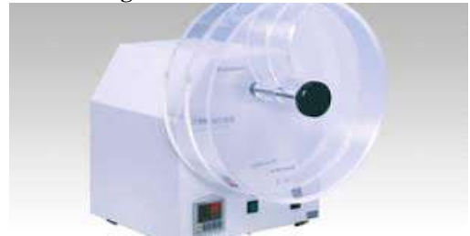
Figure 4: Roche friabilator

Friabilator is the instrument which is used to detect the friability of the tablets .Friability is the combined effects of shock and abrasions. So to resist shock and abrasions friability test is done for the tablets. In this a no. of tablets are put in the friabilator and revolves at 25rpm,dropping the tablets a distance of six inches with each revolutions.